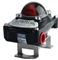
LIMIT SWITCH BOX